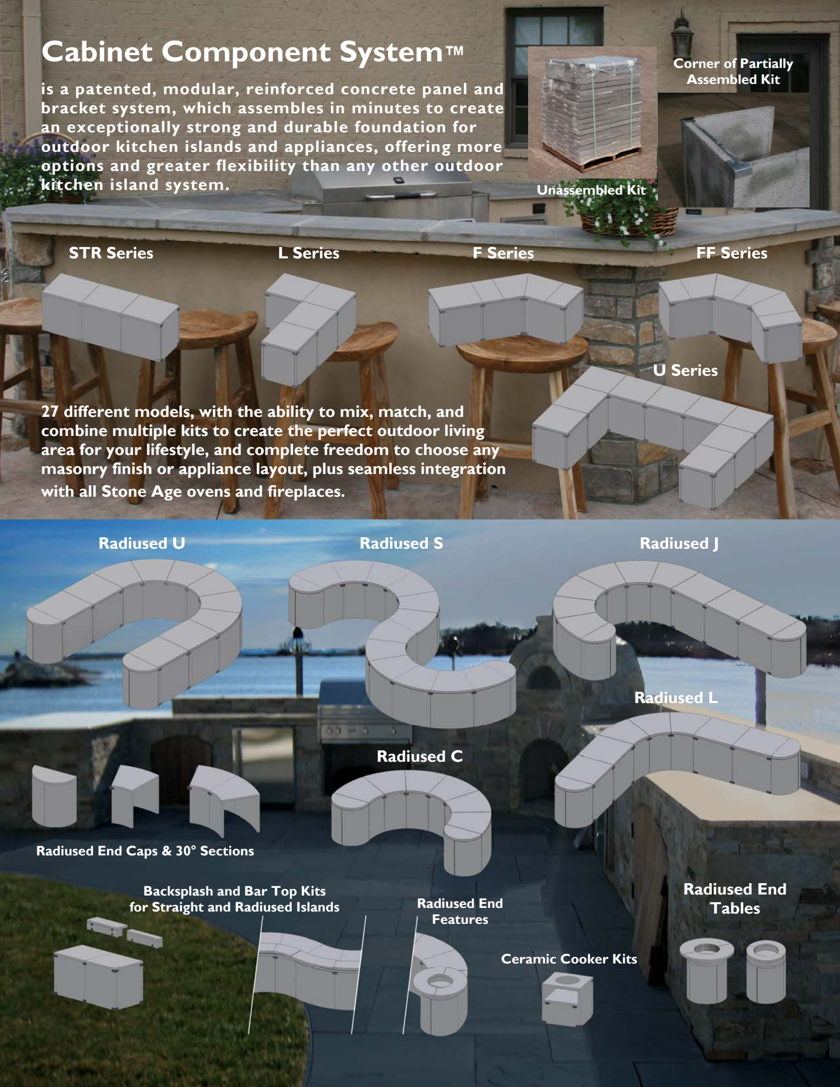
Radiused End Tables