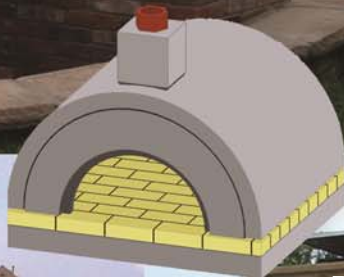
Amerigo™ Pizza Oven